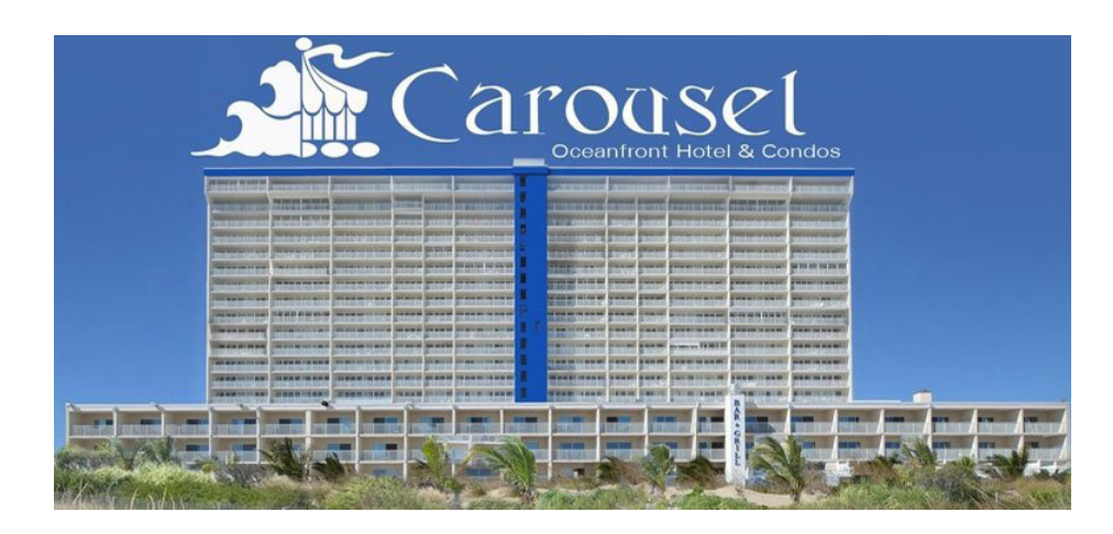
Carousel Hotel Ocean City, Maryland

42nd Annual Symposium & Exhibition Sponsored by the Maryland/DC Society for Respiratory Care